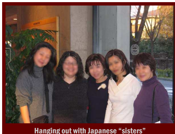
Hanging out with Japanese "sisters"

even tried to pretend that I didn't hear, but of course God won and finally I was willing to pursue His direction. It was then that my long journey of healing began.