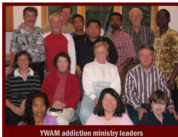
YWAM addiction ministry leaders

This is where God dealt with me on a deeper level and healed me from my past issues so that I could now testify that I genuinely love my parents. I believe that God healed me and is continuing to restore my life so that I can serve – with empathy – those who are also suffering with addictions, living in despair, hopelessness, depression, and misery. As anyone can imagine, this can be very stressful, hard work but I believe this is the ministry God has called me to in this season of my life.