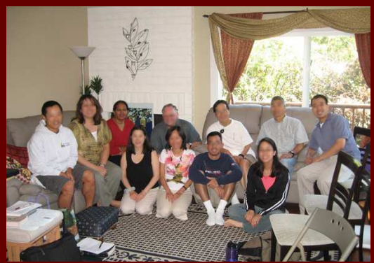
Board of Directors and Executive Directorship Team