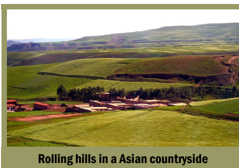
Rolling hills in a Asian countryside

We are looking forward to investing our second half in the Kingdom business. Our pursuit will be to fulfill His Dream of sharing the Good News with those who have yet to hear it.