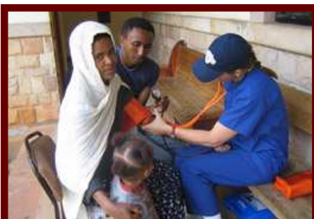
Medical missions in Ethiopia

The meetings were set up under a similar structure to the meetings in my medical school and little did I realize that back at that time God was training me as a medical student for my current work as a resident and community physician.