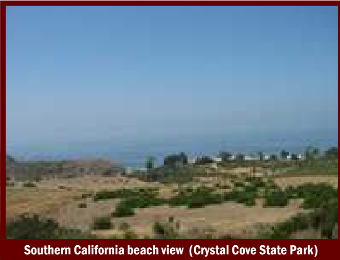
Southern California beach view (Crystal Cove State Park)

Los Angeles ◦ We are thankful to God for everyone who came to the WCF LA prayer fellowship in recent months.