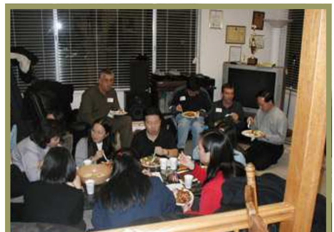
Fellowshipping over a meal

“You are the salt of the earth. But if the salt loses its saltiness, how can it be made salty again? It is no longer good for anything, except to be thrown out and trampled by men.” Matt. 5:13